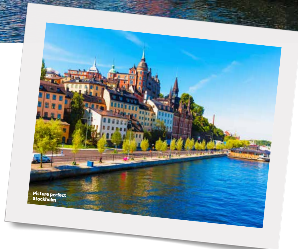
Picture perfect Stockholm

Here's a peek into the best things both these wonderful cities have for you...